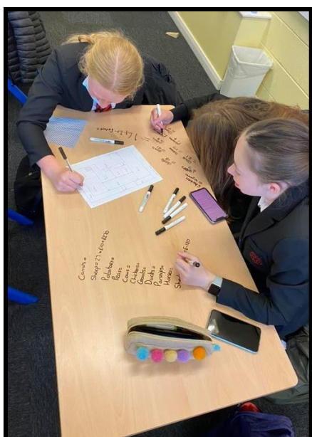
Year 8 Maths students solving a range of real life problems while building Stamper Farm!