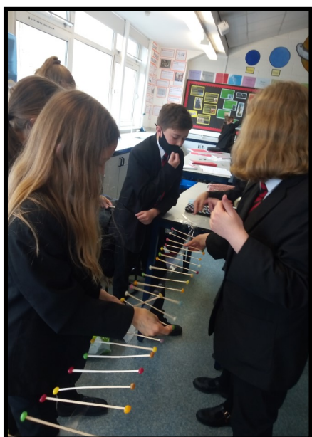
Year 7 students making a wave machine from jelly beans in Science lessons.