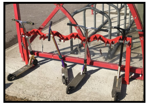
A new scooter storage rack has been installed, next to the bicycle shelter, at the Martongate entrance. Students need to bring their own padlock to secure their scooter.